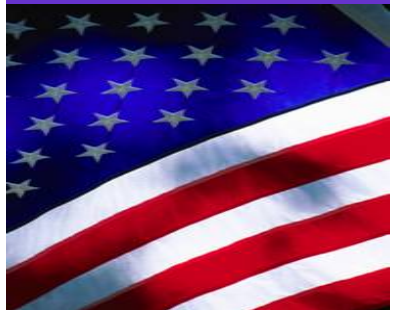
Happy 4th of July

The opinions expressed herein does not necessarily represent the views and opinions of Friendship Baptist Church