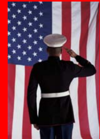
God Bless America & Our Troops

The opinions expressed herein does not necessarily represent the views and opinions of Friendship Baptist Church.